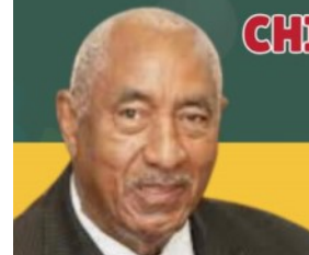
MAYOR OF LINCOLNVILLE ENOCH DICKERSON III

CHILDREN MUST BE PRESENT TO RECEIVE SUPPLIES!